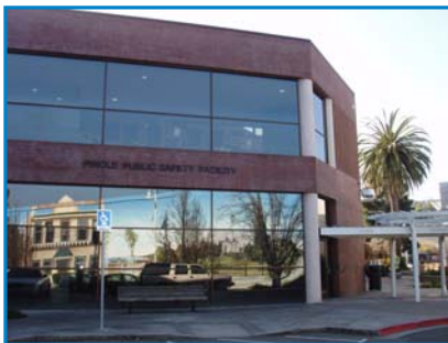
Pinole's Public Safety Building at 880 Tennent Avenue