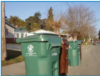
Richmond Sanitary Service provides weekly solid waste and recycling collection to Pinole.

Solid waste from Pinole is transported to the Portero Hills Landfill in Suisun City in Solano County (25 miles away) for disposal. The WCCIWMA has a contract with Portero Hills Landfill through 2014, at which point the contract will be renegotiated. The estimated remaining capacity of Portero Hills Landfill is 38.1%.