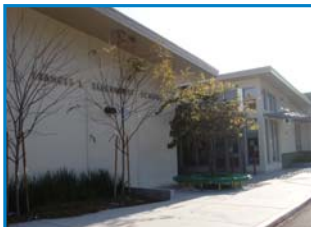
Ellerhorst Elementary School in Pinole.

Pinole will continue to encourage the location and growth of health-related facilities within the city. Pinole will also take advantage of opportunities to reuse the existing Doctors Hospital site for medical purposes when considering redevelopment options for this site.