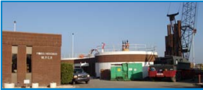
The Pinole/Hercules Water Pollution Control Plant in Pinole.

The District's Capital Improvement Program for the water system primarily involves maintaining infrastructure, constructing water supply improvements and regulatory compliance strategies. This is expected to provide adequate capacity for future growth in Pinole.